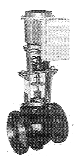
Typical of MS-8XX1X, MSR-8801X, MSR-8601X and MSR-8701X Series Actuator Assembly